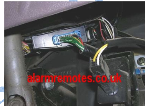
Master etc 1