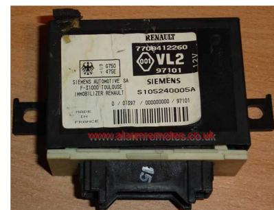
Single Plug decoder

The early Clio Decoder unit is located behind dash..about opposite where drivers right knee would be. It just pulls off. If this unit (see left) is not there then look for this one (single plug decoder) located further over towards the door and higher