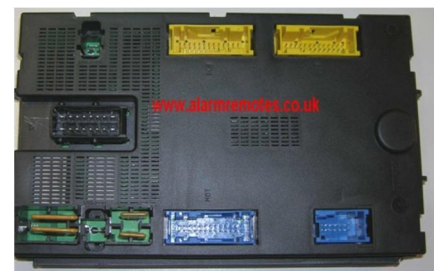
Espace Body control unit

If yours is the later Espace IV then we need this unit from passenger side. On the Espace IV the immobiliser warning light can't be extinguished